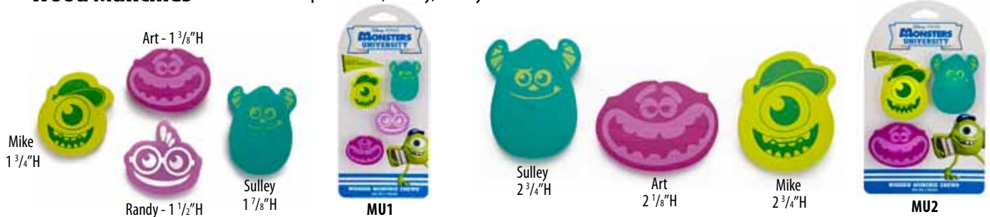
Mike 1 3/4"H