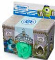
MU30 Chipboard with Fluff